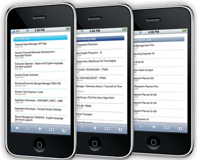
Figure 2. .jobs Microsites—mobile platform

.jobs Microsites are also optimized for access on mobile browsers for the on-the-go job seeker, providing an out-of-the-box, mobile recruiting solution (Figure 2).