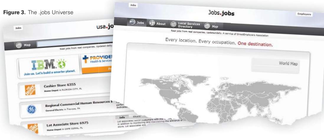
Figure 3. The .jobs Universe

The .jobs Universe is a revolutionary Internet platform ending in the .jobs suffix.